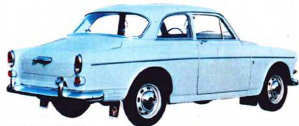
122 S Two-door Sedan