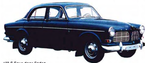
122 S Four-door Sedan