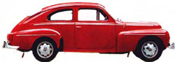
544 Two-door Sports Sedan