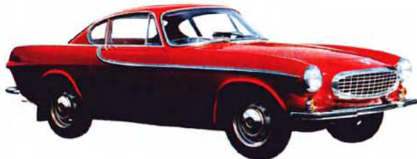
1800 S Touring coupe