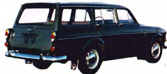
122 S Station Wagon